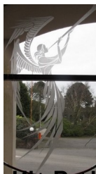
LINK to a Source: https://www.facebook.com/StackallenStPats/