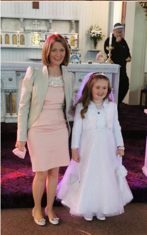
The children said it with flowers