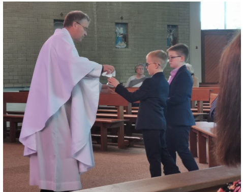
PRIEST: " The Body of Christ!"