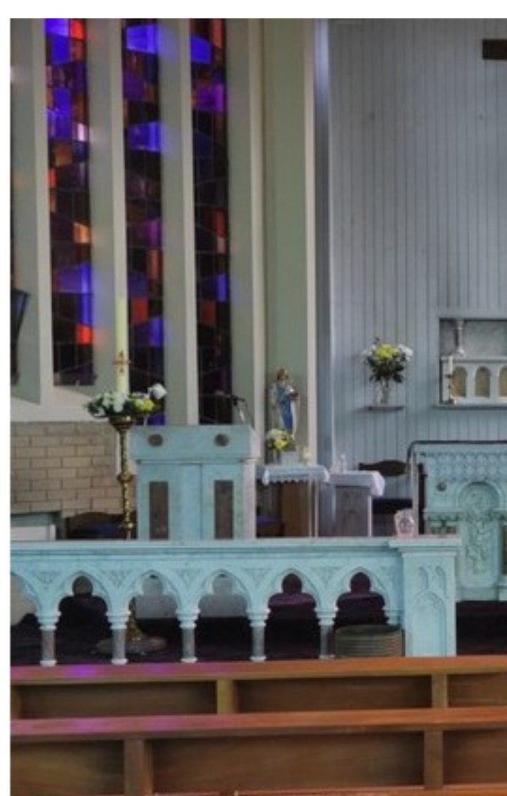
Our Lady of Hatingsent in the tabernacle, awaits . . .