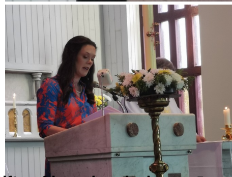
Gifts of bread and wine ....