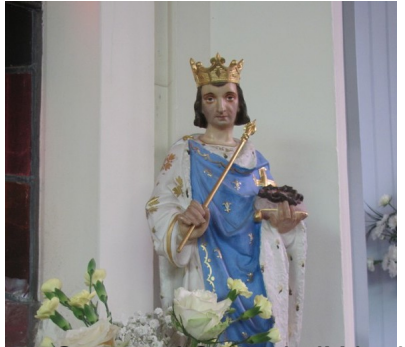
Statue of St Louis IX in the church